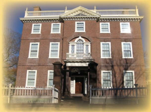
John Brown House (National Register of Historic Places)