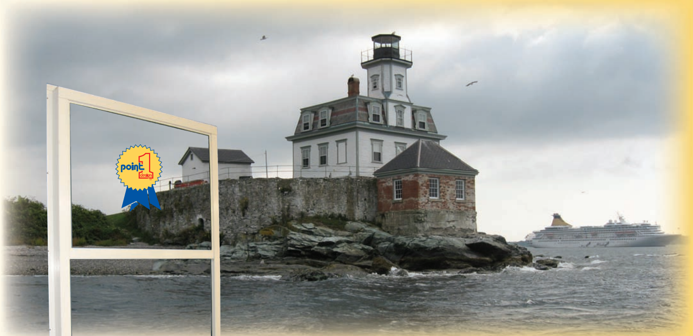
Point 1™ storm windows protect the Rose Island Light House in Narragansett Bay.

Point 1™ storm windows are constructed of high tensile strength, 6063 T6 aluminum (the industry standard is T5), and are ideally suited to rigorous applications, period homes, or your castle.