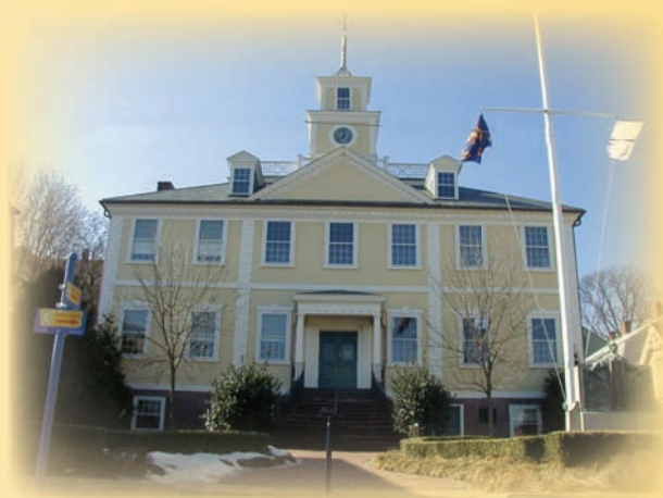
East Greenwich Town Hall (National Register of Historic Places)