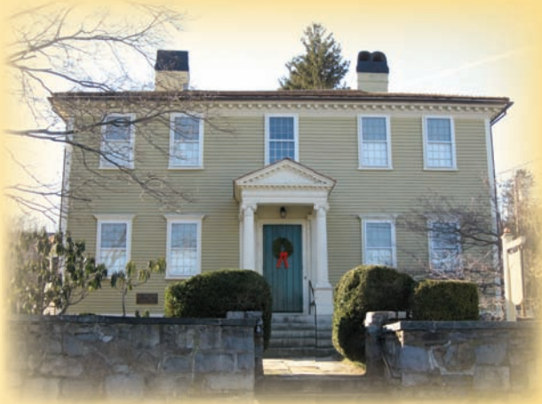
Varnum House (National Register of Historic Places)

Point 1™ products blend in a way that is faithful to the original design and character of a variety of architectural designs. (Architect-specified Point 1™ storm windows have been approved and welcomed on many historic applications where other leading storm windows have been rejected.)