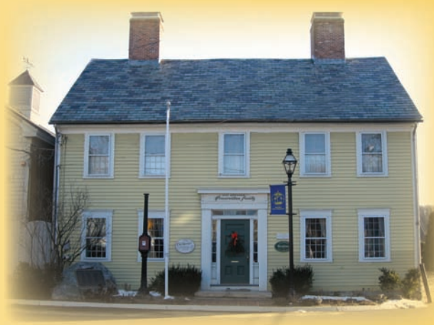
East Greenwich Preservation Society (National Register of Historic Places)