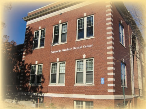
Samuels Sinclair Dental Center