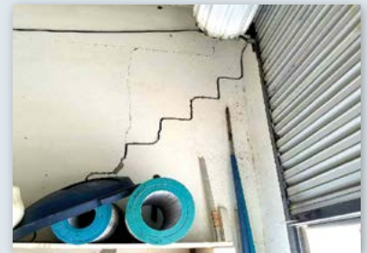
Stair-step crack from building corner interior