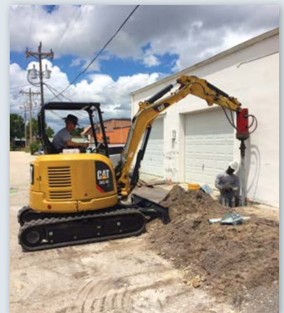
Advancing helical pier within alley