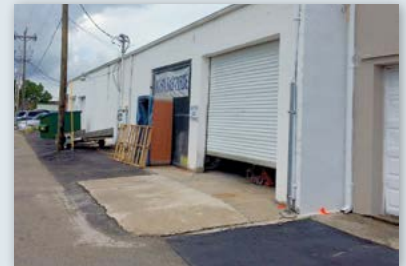
Back wall of white building settling toward corner in foreground

Structural Engineer: TKW Consulting Engineers, Inc. Geotechnical Engineer: Ardaman & Associates, Inc. Certified Pier Installer: N Square, Inc. Products Installed: (11) Foundation Supportworks HP288 Helical Piers, 10"-12" Helix Plate Configuration, Design Working Compression Loads from 10 to 20 kips, Installed Depths up to 21 feet Below Footing