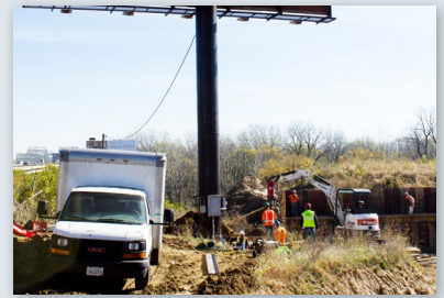
Billboard and adjacent retaining wall construction

Structural Engineer: AEdifica Case Engineering Geotechnical Engineer: SCI Engineering, Inc. General Contractor: Pinnacle Contracting, Inc. Pier / Tieback Installer: Foundation Supportworks® by Woods Products Installed: (2) Supportworks® HP288 Helical Tiebacks, 8"-10"-12" Lead Section, Design Working Tension Load of 22 kips; (3) Supportworks® PP288 Push Piers, Installed Depths from 25 to 27 feet, Design Working Compression Load of 23.5 kips