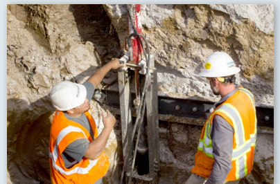
Driving PP288 push pier