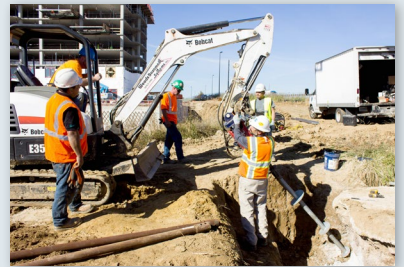
Positioning helical tieback lead section for advancement