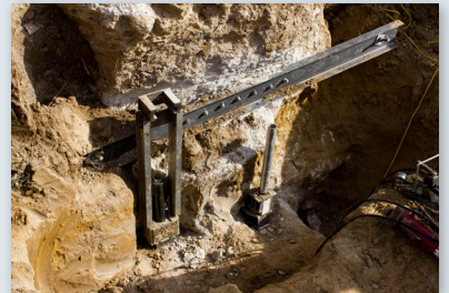
Tiebacks and waler installed; Retrofit brackets positioned for push pier installation