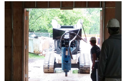
Skid steer with drive head entering building