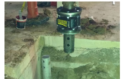
Calibrated torque transducer used to measure and record torque