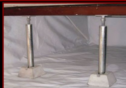
The clean, bright white liner allows you to easily see that your crawl space is free of mold, insects and dirt.