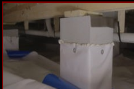
The CleanSpace liner is sealed around objects such as pipes, columns, and piers.

If your wood crawl space joists, girders, and/or supports in your crawl space were damaged by mold, rot, and moisture, then you will want to address these issues to prevent future damage. L.R.E.'s CleanSpace System completely isolates your home from the earth. This dramatically reduces the humidity level in the air which, when combined with sealing outside air and dehumidification, will eliminate moisture-related damage and associated structural problems that occur when framing members rot and deteriorate. The encapsulation process involves sealing all crawl space vents, installing an airtight crawl space door, and lining crawl space walls and floors with a durable plastic liner. L.R.E.'s crawl space encapsulation system will give you a clean, dry space that won't give you problems in the future.