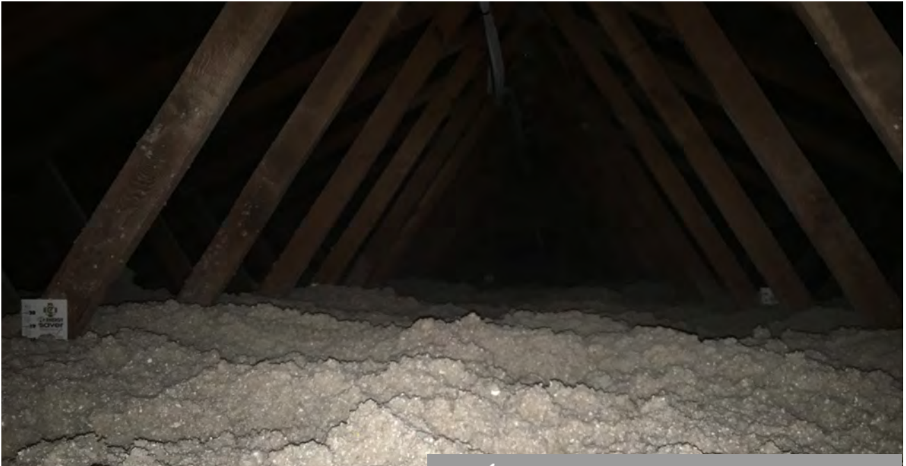
Blown Cellulose in Attic