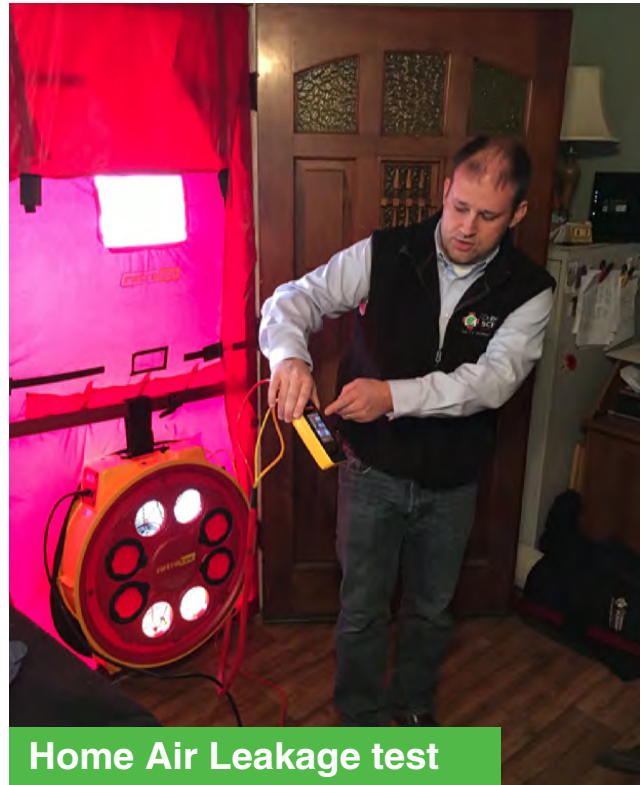
Home Air Leakage test