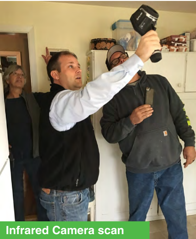
Infrared Camera scan